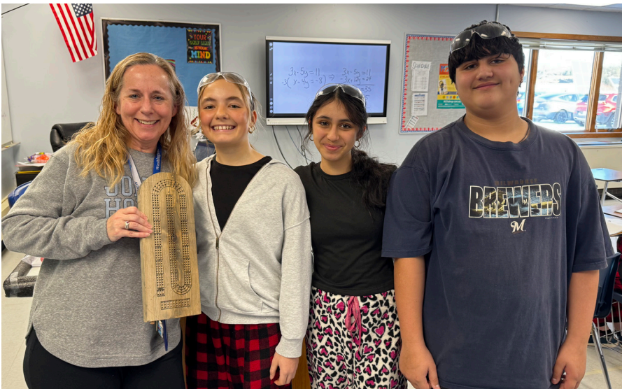
“When Math and Tech Collaborate” WISD 6, 7 & 8th graders learned how to play Cribbage in Math class while learning how to make a cribbage board using the CNC (computer Numerated Control) router in Tech Class.