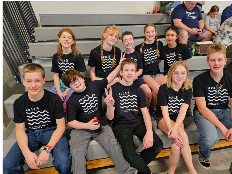
SeaPerch Regional Teams prepare to compete on Saturday, March 1.